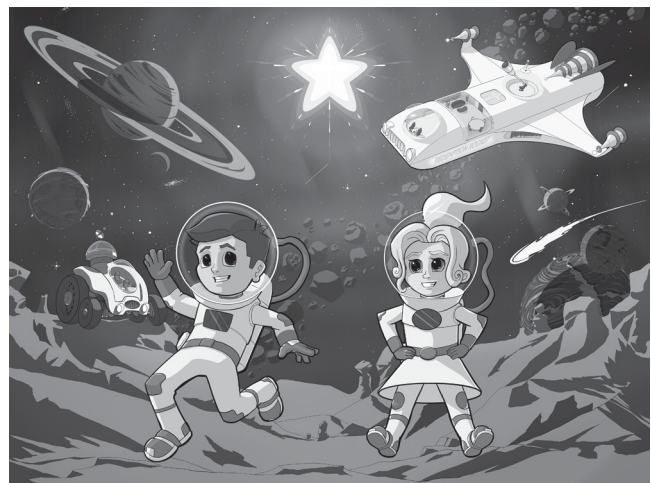
Redemption Rocketship Mural